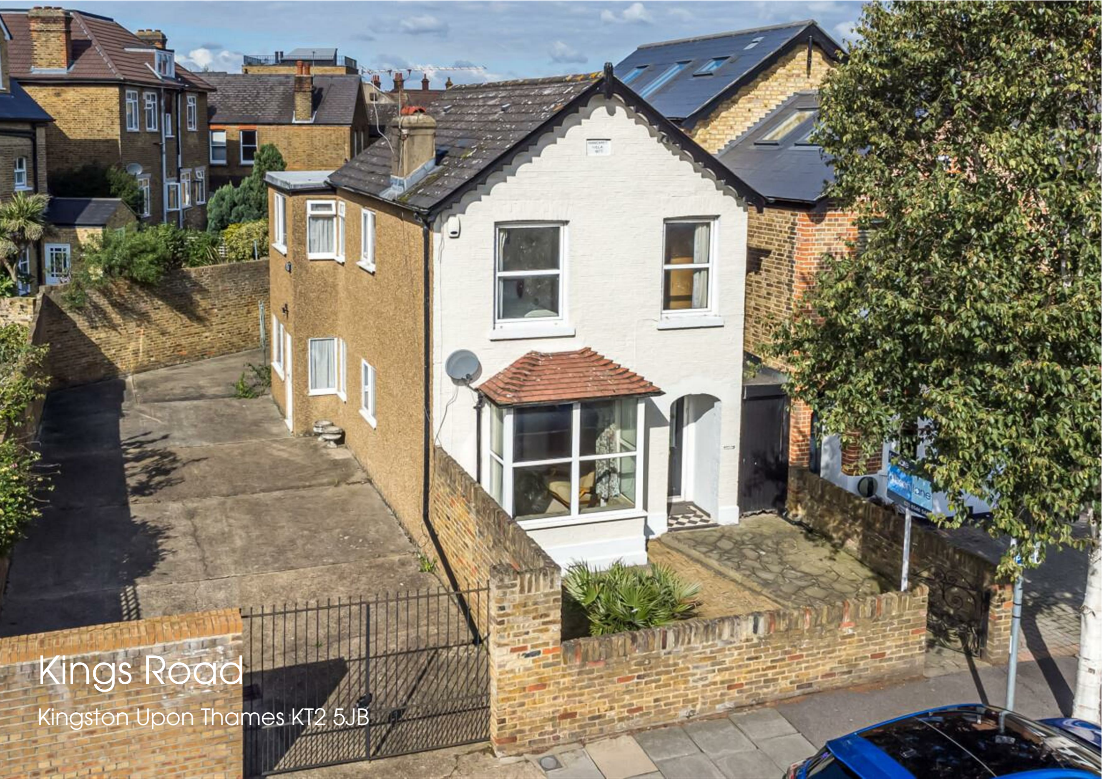
Kings Road Kingston upon Thames KT2 5JB